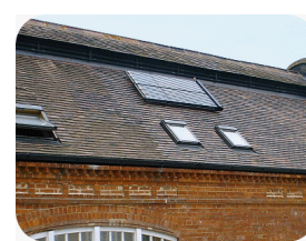
An example of a solar heating