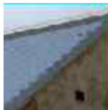
An example of PV roof tiles.