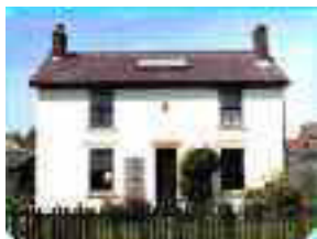
Example of roof Mounted PV.